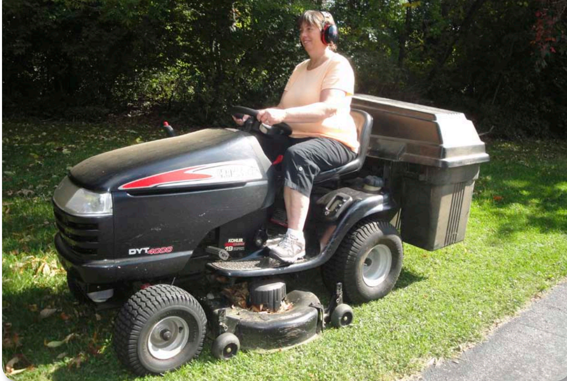
Photo 1: A common lawn tractor that was included as part of this noise sampling study. The use of hearing protection is encouraged.

blade. In the 500 to 2000 Hz frequency range edge noise due to turbulence shed from the trailing edge of the blade is dominant.