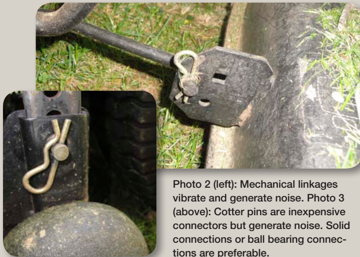
Photo 2 (left): Mechanical linkages vibrate and generate noise. Photo 3 (above): Cotter pins are inexpensive connectors but generate noise. Solid connections or ball bearing connections are preferable.

Mower decks, engine housings and mechanical linkages are parts that can vibrate and propagate noise (Photos 2, 3). Various options to incorporate into new lawn tractors to reduce noise radiation include the following concepts: