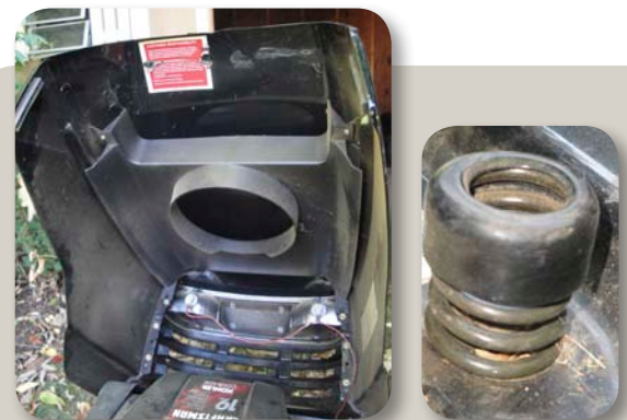
Photo 4 (left): Metal housings vibrate and generate noise such as this example. Plastic or fiberglass housings provide more internal damping and reduce noise propagation. Photo 5 (right): Springs and rubber material can be used to isolate and dampen vibrating parts.

Many employees work all day outside continually operating lawn care equipment. These workers' personal noise exposure can conceivably reach or exceed the ACGIH TLV 82 dBA based on an 8-hour exposure. Workers' exposure should be determined through noise dosimetry sampling and, based on the results, a hearing conservation program may be warranted. Individuals who work for extended periods riding tractors and operating lawn care equipment should be trained in the use of hearing protection and encouraged to use earplugs or earmuffs while working.